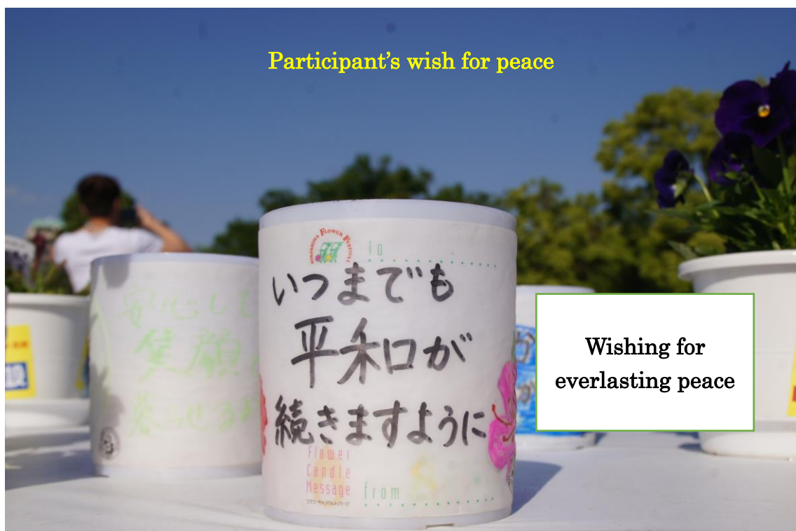
Participant's wish for peace