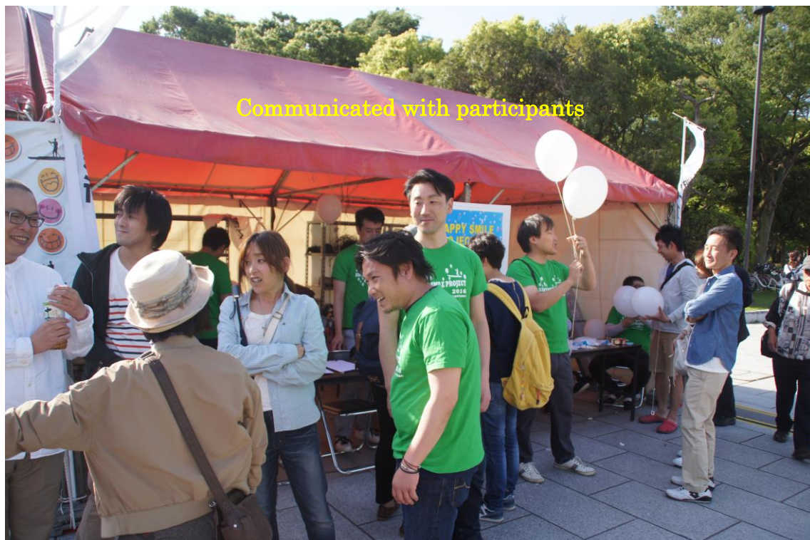
Communicated with participants