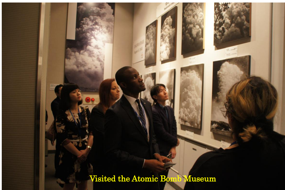
Visited the Atomic Bomb Museum