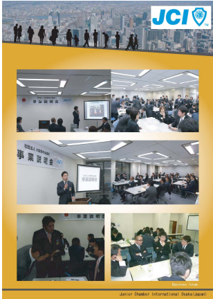
Junior Chapter International, Osaka/Japan

To get new members to understand our movement deeply, take an active part in ASPAC and world conventions, and develop a relationship with the world. (Training)