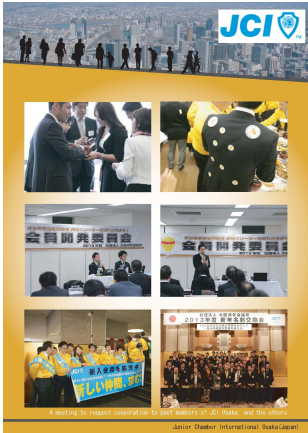
A meeting to request cooperation to local residents of JCI Osaka and the others