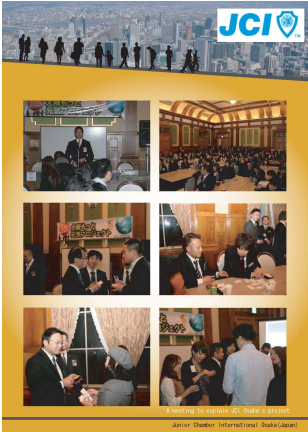
Junior Chapter International, Osaka/Japan