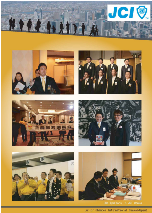
On reception to JCI Osaka