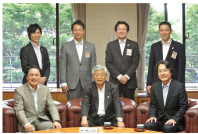
Visiting the Mayor of Yamagata city and tell him about launching a new project