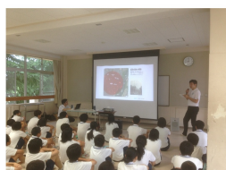
2014.7.10 The peace study program of Nagaoka Air Raid and Kaki-river Floating Lanterns in South junior high school.