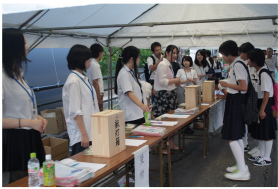
2014.8.1 Memorial program The 51st Katsuragi Floating Lanterns - Connecting The Memorial Lights With The Future Student volunteers of 55 people helped the set-up.