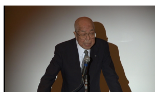
Nagaoka Air Raid experiences Air Raid chairman has recorded in teaching materials DVD "The August 1, 1945 Handled Down From Generation To Generation"