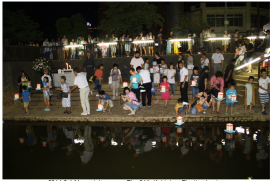
2014.8.1 Memorial program The 51st Katsuragi Floating Lanterns - Connecting The Memorial Lights With The Future Many participants mourned for those who passed away in the Nagasaki air raid, and strengthened the wish in peace.