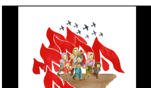
Digital picture-book "August 1, 1945 of that summer" The Nagaoka Air Raid scene