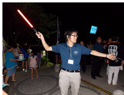
2014.8.1 Memorial program The 31st Kaki-river Floating Lanterns - Connecting The Memorial Lights With The Future The member who controls traffic