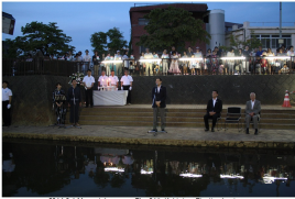
2014.8.1 Memorial program The 51st Katsuragi Floating Lanterns - Connecting The Memorial Lights With The Future The Katsuragi mayor participated and He mourned for those who passed away in the Nagasaki air raid.