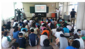
2014.7.8 The peace study program of Nagaoka Air Raid and Kaki-river Floating Lanterns in Kibou-ga-oka elementary school.

Cooperating with the Nagaoka city office, the elementary school, and the junior high school, we gave the opportunity to study the historical facts of the Nagaoka air raid which attacked the community to children. By this, we urged children to become an active citizen who aims at realization of peaceful society.