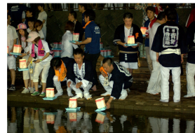
2014.8.1 Memorial program The 31st Kaki-river Floating Lanterns - Connecting The Memorial Lights With The Future Membership Participation