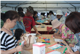
2014.8.1 Memorial program The 51st Katsuragi Floating Lanterns - Connecting The Memorial Lights With The Future The number of visitors was 3,100 an increase of approximately 120% from 2,600 last year.