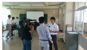
2014.7.8 General Manager to receive the interview of the TV station about The peace study program of Nagaoka Air Raid and Kaki-river Floating Lanterns in Kibou-ga-oka elementary school.