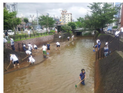
2014.7.21 Pre-cleaning of Kaki-river by LOM members

Describe the main roles of the participating members in this program. General manager (1 person): Supervision of the entire project Assistant General Manager (4 person): Assistant the supervision Project chief (2 person): Leader of each program Negotiator (4 person): Negotiations with other organizations Sound and image design (2 person): Management of sound and video to be used in the project PR agent (6 person): Implementation of PR to citizens Site management (11 person): Construction of the venue Hearing (6 person): The hearing for the participant