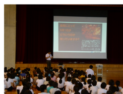
2014.7.11 The peace study program of Nagaoka Air Raid and Kaki-river Floating Lanterns in Sakuraba elementary school.