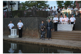
2014.8.1 Members to prepare for the ceremony in Memorial program The 31st Kaki-river Floating Lanterns - Connecting The Memorial Lights With The Future