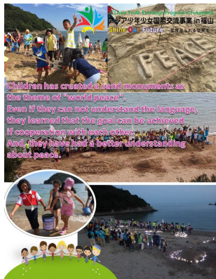
Junior Chamber International Fukuyama