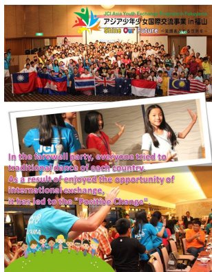
Junior Chamber International Fukuyama