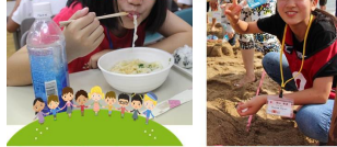
Junior Chamber International Fukuyama

Seven companies showed an understanding in this project. These companies have provided total $1,200 and 1,200 bottles of mineral water as sponsors. As a result, operating costs have been reduced.