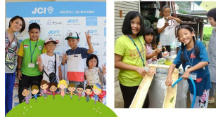
Junior Chamber International Fukuyama

JCI Asia Youth Exchange Program in Fukuyama. By providing the opportunity of international exchange to the children, and give a positive change for children to become human resources who are active in the international community of the future.