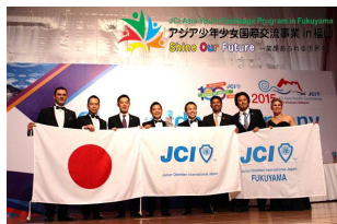
AYEP2014 won the AWARD in ASOCC2015. This project was a lot of attention from many of NCA of JCI. We were able to spread our movement widely. Junior Chamber International Fukuyama

How did the program advance the JCI Vision? This program enabled JCI Fukuyama to build up internationally close network , which gave great resources to the development of the program JCI Fukuyama. To expand the network is the big step forward to be the leading global network of young active citizens. JCI Fukuyama and JCI Elite (Malaysia), JCI Boai(Taiwan), JCI Phnom Penh(Cambodia), JCI Ulan Bator(Mongolia) , JCI Yogyakarta(Indonesia), JCI Hatyai(Thailand), JCI Vietnam Central Saigon(Vietnam), JCI Eastern(Australia), JCI Manila(Philippine) conducted the project in cooperation by establishing a Global Partnership to advance JCI Vision.