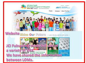
Junior Chamber International Fukuyama

JCI Fukuyama(Japan), JCI Elite(Malaysia), JCI Seoul(Taiwan), JCI Phnom Penh(Cambodia), JCI Ulan Bator(Mongolia), JCI Hatyai(Thailand), JCI Manila(Philippine), JCI Eastern(Australia), JCI Yogyakarta(Indonesia), JCI Vietnam Central Saigon, Nine LOMs have cooperated to implement the program. By establishing original partnership, we have promoted "JCI Vision."