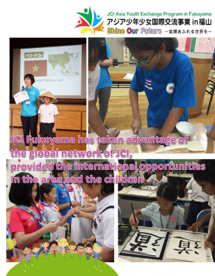
Junior Chamber International Fukuyama