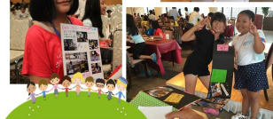
Junior Chamber International Fukuyama

JCI Fukuyama will continue to offer an opportunity for world international exchanges, which should contribute significantly to the realization of JCI aims world peace.