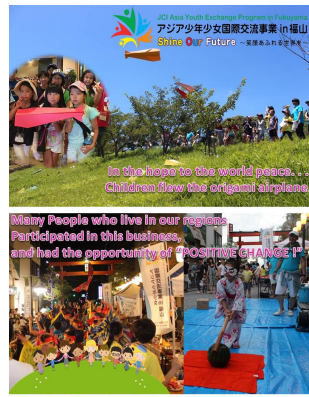
Junior Chamber International Fukuyama