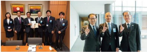
Former Minister of Education