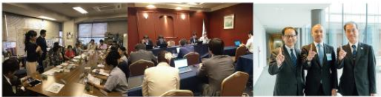
Meeting with NPOs Meeting with TOKYO Meeting with Ministry of Education