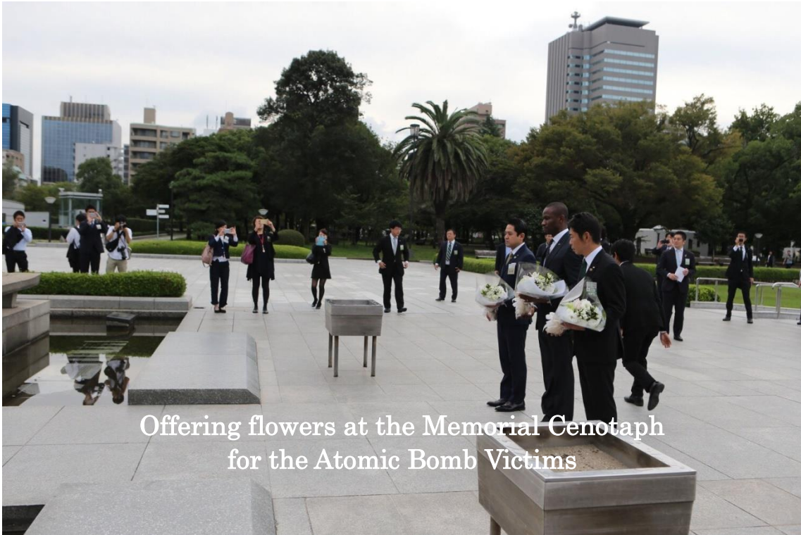
Offering flowers at the Memorial Cenotaph for the Atomic Bomb Victims