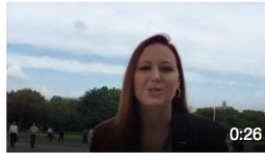
Coming soon JCI President at the Hiroshima Peace Memorial... October 9, 2016 · 669 views