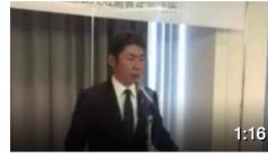
Peace is Possible 平和の実現 Peace Program by JCI... October 9, 2016 · 309 views