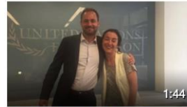
A special message to JCI members from Nothing But Nets! June 21, 2016 · 8.3K views