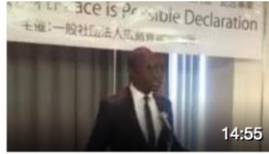
Peace is Possible 平和の実現 Peace Program by JCI... October 9, 2016 · 1.2K views