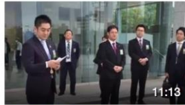
Peace is Possible Declaration at Hiroshima Peace Memorial... October 9, 2016 · 1.6K views