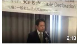
Peace is Possible 平和の実現 Peace Program by JCI... October 9, 2016 · 521 views