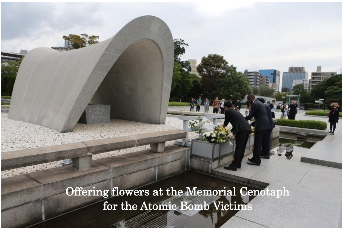
Offering flowers at the Memorial Cenotaph for the Atomic Bomb Victims