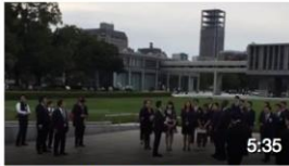
Peace is Possible President Pachal attending the Peace... October 9, 2016 · 3.7K views