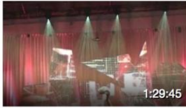
2016 JCI World Congress Opening Ceremony in Québec... October 31, 2016 · 35K views