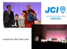
Invited the 14th Dalai Lama