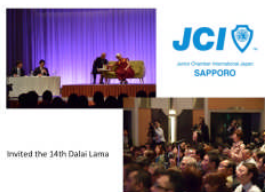
Invited the 14th Dalai Lama