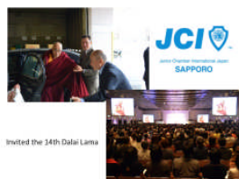
Invited the 14th Dalai Lama