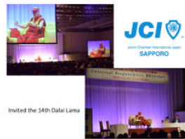
Invited the 14th Dalai Lama