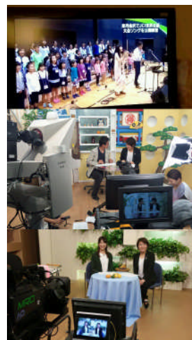
TV programs 🎵