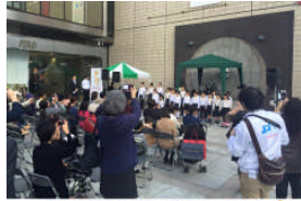
Downtown Concert 🎵