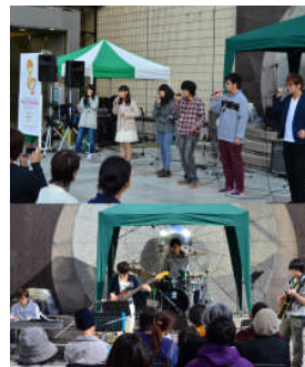
Local musical organizations