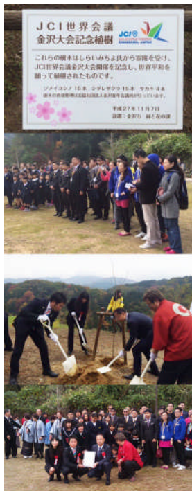
Tree-planting ceremony with Twinning JC (JCI Harbour ,JCI Seongbuk , JCI Xinzhuang, JCI Freiburg )