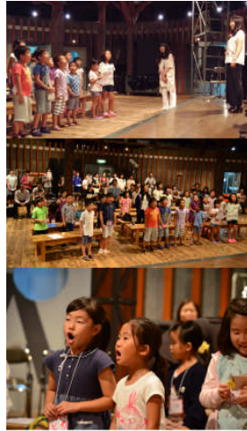
Chorus group practice