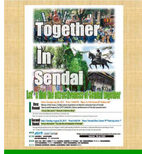
JCI Innovation ! For more attractive Sendai 2015