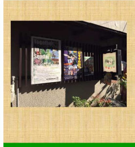
JCI Innovation ! For more attractive Sendai 2015