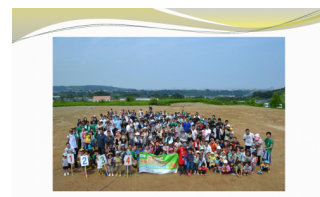
He spreaded CSR Activities to companies in community

JCI Junior Chamber International KANAZAWA