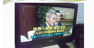
TV Program was broadcasted as a Leader of the community!

JCI Junior Chamber International KANAZAWA