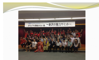
He brought Young Active Students to be a Global Networker

The local community becomes a sustainable society.