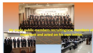
To make public members recruiting new members of important and acted on his own initiative.