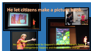
He let citizens make a picture book.