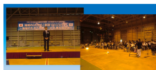
He investigated Okadama air port is center of Sapporo but the customer was decreasing

He understood that Sapporo citizens hope to improve air plain performance for jet noise result of a hearing