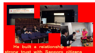
He built a relationship of strong trust with Sapporo citizens