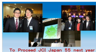
To Proceed JCI Japan 55 next year