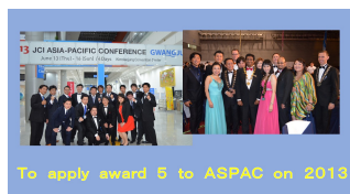
To apply award 5 to ASPAC on 2013

4. To apply award 5 to ASPAC on 2013. He provided opportunity understood