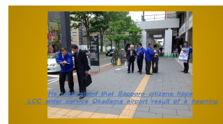
He understood that Sapporo citizens hope LCC enter service Okadama Airport result of a hearing