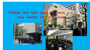
Follow the last year to sent out new leader for JCI Japan