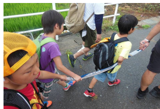
Helping each other for the goal