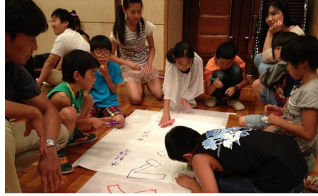
Preliminary briefing session (making the team flag)