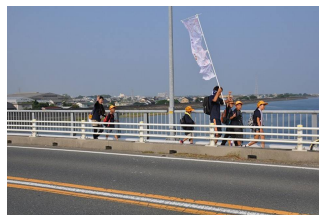
Walking, walking !

Their parents are sure that they can change their mind and attitude with the change of the children.