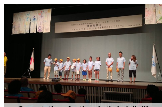
Presentation of actions in their daily life (1 month later they had walked)