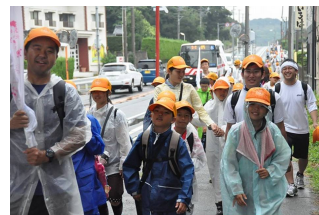
Walking in the rain. (day 3)