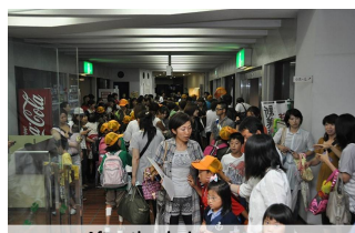
After the closing ceremony (The children met their parents.)