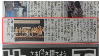
News release at the news paper