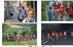
Working Together (JCI Handa prepared colored T-shirt every team)