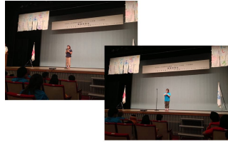
Impression speech of the children's parents and citizen volunteers.