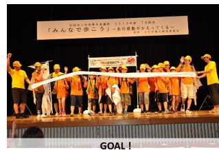
GOAL ! We waited with the parents of participants.