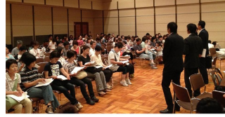
Briefing session (for parents)