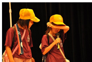
Impression speech of the participants

Obtaining the change called "Positive Change", a large number of the children made Young Active Citizen in the local communities.