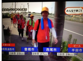
News release at the local cable television