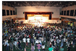
May 25, 2013 State of "FASHION SHOW"