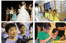
Smile and Serious look of the participants