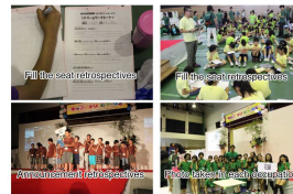
Looking back in fashion show