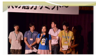
Presentation Competition to introduce Kanazawa's strengths

Students who joined properly managed the website on which they transmitted the content of training courses, JCI movement and UNMDGs to the world.