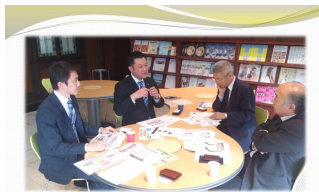
Government Organizations and Universities Visit JCI Junior Chamber International KANAZAWA