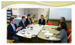
Government Organizations and Universities Visit JCI Junior Chamber International KANAZAWA