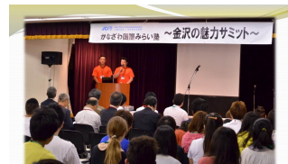
Evaluation and Award in Presentation Competition

JCI Junior Chamber International KANAZAWA