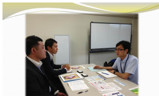
Government Organizations and Universities Visit JCI Junior Chamber International KANAZAWA