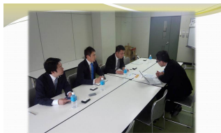
Government Organizations and Universities Visit JCI Junior Chamber International KANAZAWA