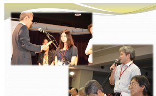
Evaluation and Award in Presentation Competition

JCI Junior Chamber International KANAZAWA