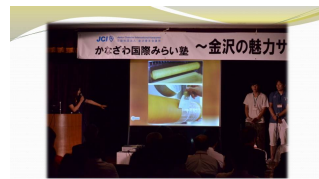
Presentation Competition to introduce Kanazawa's strengths

JCI Junior Chamber International KANAZAWA