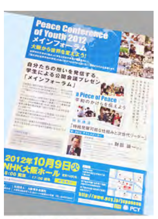
A PCY2012 Main Forum Poster

A video link for the project "Hopkit" can be found at: "Hopkit"