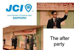
The after party

.To increase the number of nominees, we will provide incentives and benefits from receiving the award. We will keep promoting activities of award recipients, with adding new information of activities taken after receiving award.