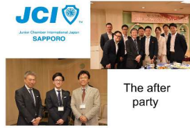
The after party