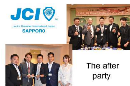
The after party