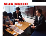
Hokkaido Thailand Club