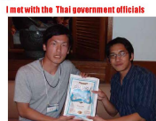
Met with the Thai government officials