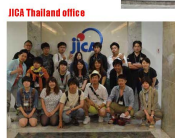
JICA Thailand office