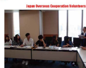
Japan Overseas Cooperation Volunteers