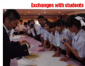
Exchanges with students