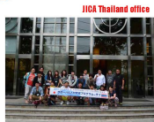
JICA Thailand office