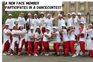
A NEW FACE MEMBER PARTICIPATES IN A DANCE CONTEST