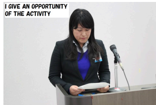
I GIVE AN OPPORTUNITY OF THE ACTIVITY