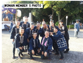
WOMAN MEMBER'S PHOTO