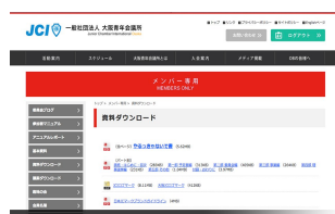
Web page of JCI Osaka