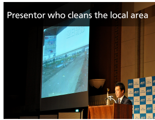
Presenter who cleans the local area