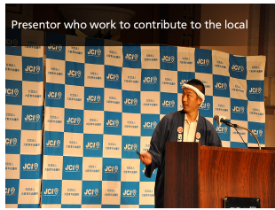
Presenter who work to contribute to the local