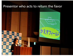
Presenter who acts to return the favor