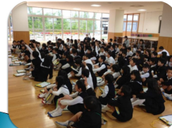
Food Education Program at the school