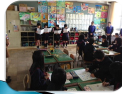
Presentation by students