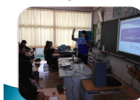
UN MDGs Program at the school