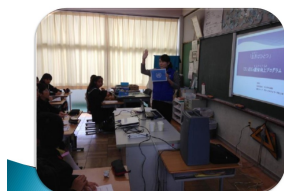
UN MDGs Program at the school