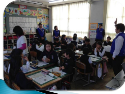
Moral Education Program at the School