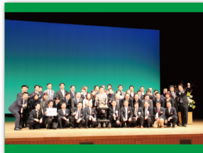
The number of staffs except JCI members increased to 66 citizens from 50 of last year.

Increase the numbers of staffs except JCI members