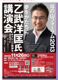
We publicized it with a poster