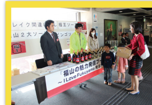
We conveyed local charm.