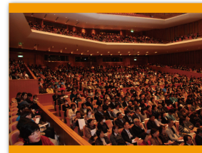
170% of participants answered that they were noticed that they are possible to participate the community development project. 890% of participants answered that they were noticed that if they act actively they can create the o'positive change to the community.