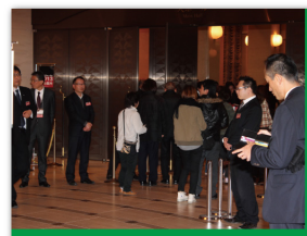
Citizens were interested in participant's action in this project, the amount of visitors increased to 2,043 people from 1,890 in the last year.