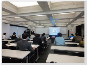
Was positive change by learning the history of the region.