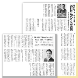
the program brought a big impact for our local community.