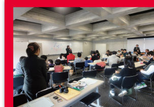
We conveyed the importance of having a dream toward children through entertainment.