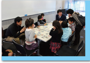
Cards were aimed to be an educational tool for kids to learn about the local community.