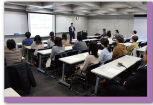
We learned so that children could go to the school happily.