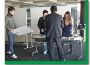
The project team of a local picture book has created a picture book which enables citizens to talk about our local community.