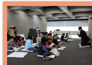
We were held to children OMOIYARI Seminar.